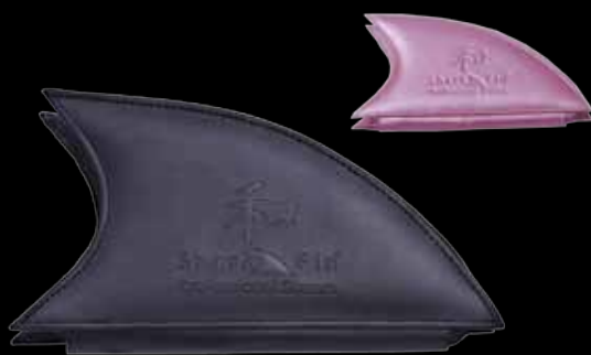
Shark Fin® Case - Black Holds two shears