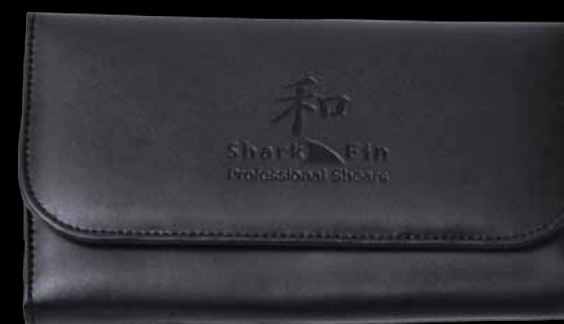
Student Kit Standard