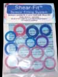
Shear Fit™ Finger Fitting System - 15 Inserts