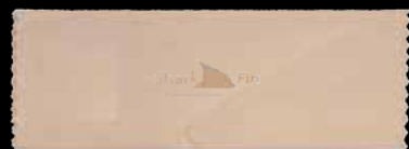
Leather Polishing Cloth