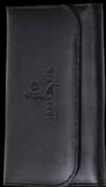
Tri-Fold Black Leatherette Pouch Holds two shears