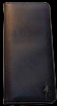
Easy Zip Black Leatherette Case Holds one shear