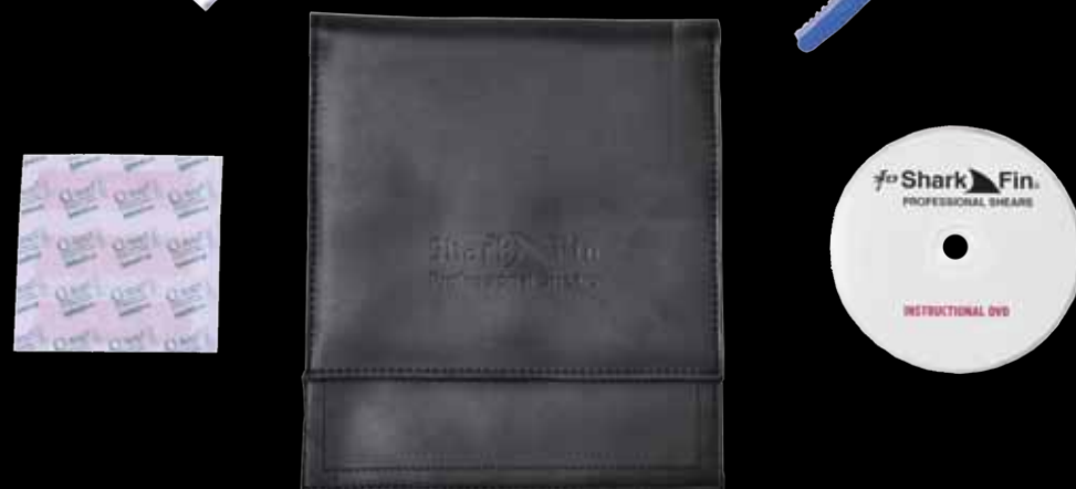
Student Kit Deluxe

Offers students the ultimate in control, performance and comfort.